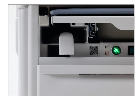
EasyGlide™ Mobility System