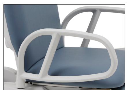
ComfortGrip™ Patient Assist Handles

Upgrade to the FLEX High-Low PLUS Power Exam Table, where advanced features meet affordability, enhancing your practice without a premium price. Designed for cost-effectiveness, this versatile table allows for customization with optional features like the innovative EasyGlide™ Mobility System and ComfortGrip™ Patient Assist Handles, ensuring superior mobility, functionality, and accessibility tailored to your clinical needs and budget. The lighter, modern cabinet color enhances the contemporary aesthetic of any clinic.