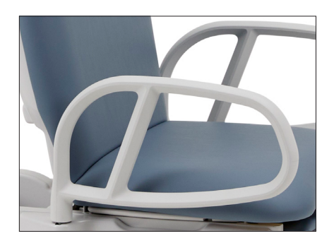
ComfortGrip™ Patient Assist Handles

Discover the Access High-Low PLUS Power Exam Table, fully equipped to meet every clinical need. Features such as ComfortGrip<sup>™</sup> Patient Assist Handles, expansive storage, and adjustable ergonomic stirrups enhance clinical efficiency and patient care. Featuring a lighter, modern cabinet color that enhances the contemporary aesthetic of any clinic. The optional EasyGlide<sup>™</sup> Mobility System streamlines exam table movement, facilitating effortless room reconfiguration and enabling easy cleaning. Embrace unmatched versatility and efficiency with this all-in-one solution.