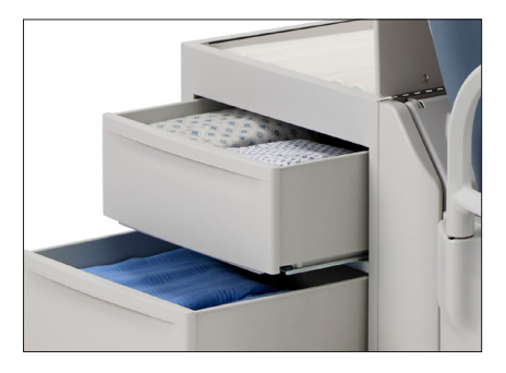
Industry Best Storage