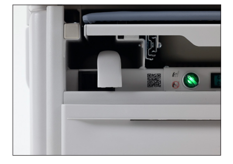
EasyGlide™ Mobility System