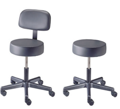
Model 22400B in Ash Model 22400 in Ash

B - Backrest FR - Footring V - Vacuum formed/Seamless LCD - Locking casters G - Glides C133 - CAL-133 upholstery UL - Ultraleather™ upholstery