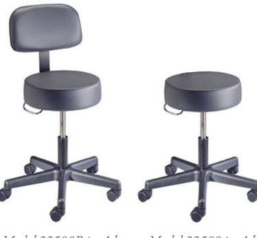
Model 22500B in Ash Model 22500 in Ash