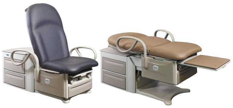
Model 6801 in Black Satin