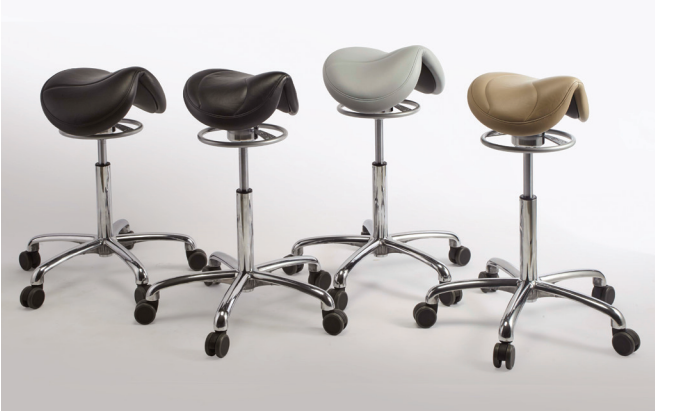
Both series are available in your choice of three upholstery colors. The 135JS Jumper is shown in Raven Wing & Dove Gray. The 135AS Amazone is shown in Raven Wing & Papyrus.

The 135AS and 135IS saddle stools are available in Brewer's three most popular UltraLeather upholstery colors: Raven Wing, which is a classic black; Dove Gray, which is a lighter gray; and Papyrus, which is a nice tan. The Dove Gray would look nice in an operatory decorated with cooler colors, whereas, the Papyrus would go nicely in an operatory with natural or warmer colors. Of course, the Raven Wing black will match any operatory.