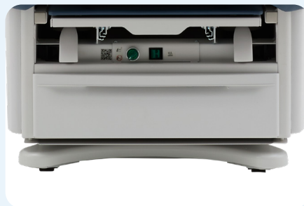
Whisper-Quiet, Effortless EasyGlide Mobility System