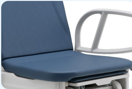
ADA-Compliant Seat Transfer Surface - 27.5" W x 17" D