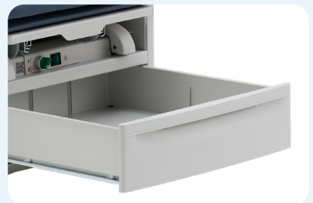
Generous Front Storage Drawer with Heater Option