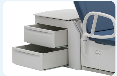
Industry-Best 6 Cubic Feet of Storage