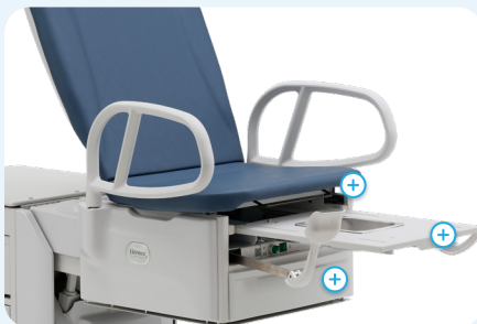
Women's Health Package: Pelvic Tilt, Stirrups & Drawer Warmer