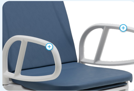
ADA-Compliant ComfortGrip Assist Handles