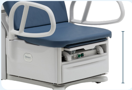
2024 Access Board ADA Recommended 17" Seat Height