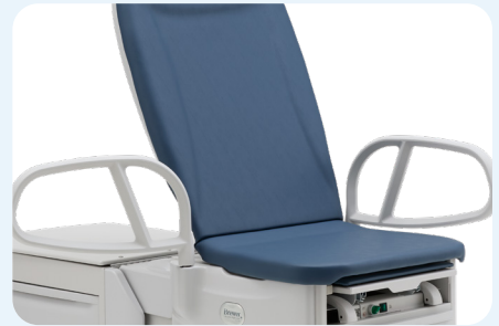
ADA-Compliant Two-Side Transfer Access