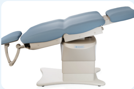
Left Lateral Plane Position