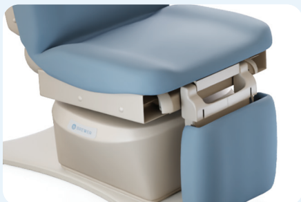
ADA-Compliant Seat Height for Wheelchair Transfers