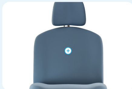
Premium Seamless Upholstery