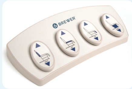
Intuitive Foot Pedal Control