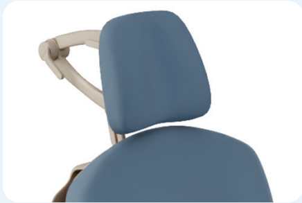
Fully Articulating Headrest