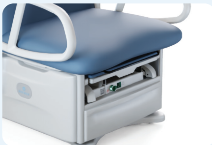
ADA-Compliant Seat Height