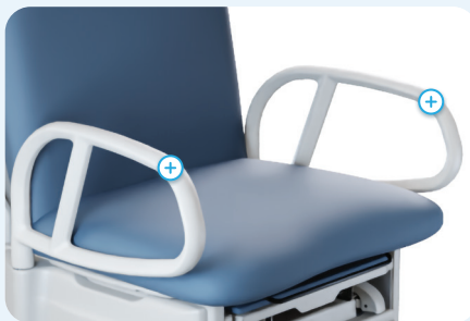
ADA-Compliant ComfortGrip Assist Handles