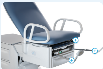
Women's Health Package: Pelvic Tilt, Stirrups & Drawer Warmer