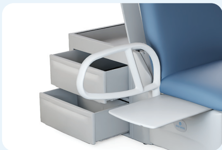
Industry-Best 6 Cubic Feet of Storage