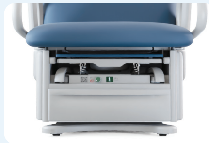
Whisper-Quiet, Effortless EasyGlide Mobility System