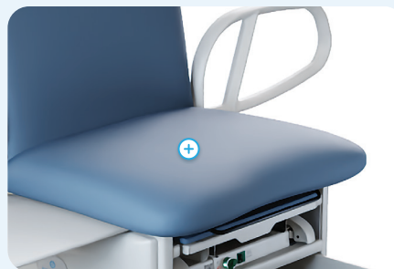
Up to 700 lb. Weight Capacity