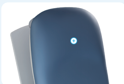
Ergonomic, PolyCloud Contour Upholstery