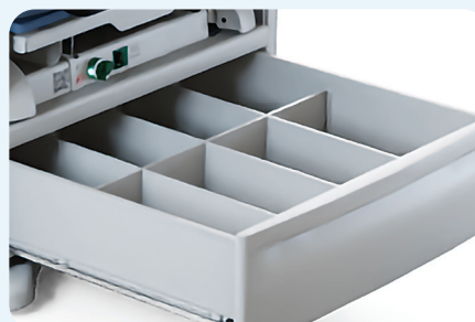
Generous Front Storage Drawer with Heater Option