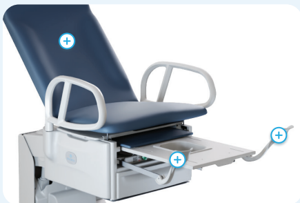
Optional Women's Health Package: Pelvic Tilt, Stirrups & Drawer Heater