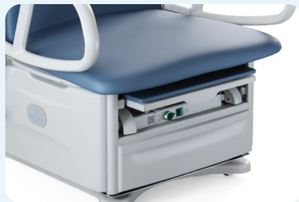
ADA-Compliant Seat Height