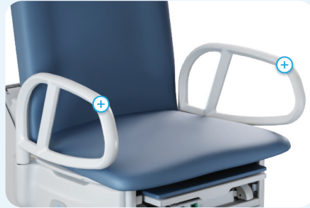
ADA-recommended ComfortGrip Assist Handles