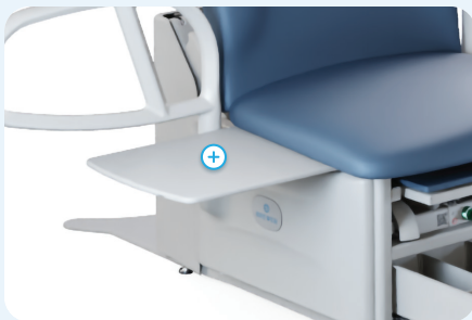
Space-Saving Mayo Pass-Through Work Surface