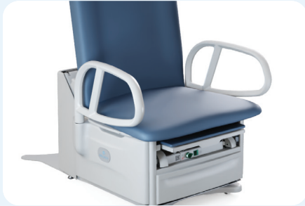
Patient-centric design, free of obstructive elements and 3 safety zones