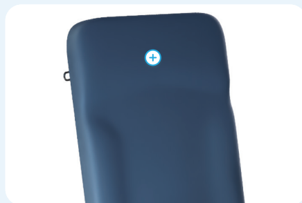
Ergonomic, PolyCloud Contour Upholstery