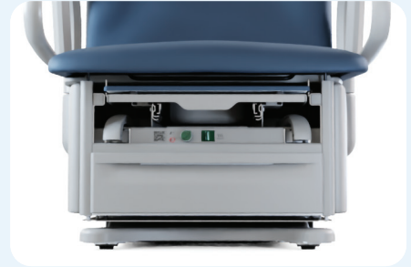
Whisper-quiet, effortless EasyGlide Mobility System