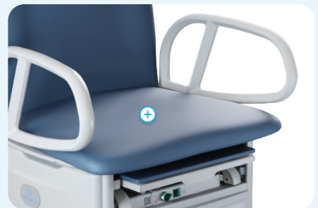
Up to 700 lb. Weight Capacity