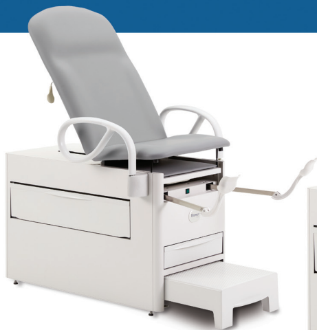
Standard top with patient assist handles, stirrups and pelvic tilt

An exam table as diverse as your patient population.