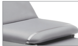
Paper Fastener Strap