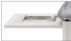
Stainless Steel Debris Pan