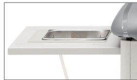
Urology Drain Pan