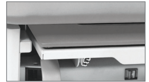
Receptacle & Heater