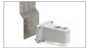
Welch Allyn Bracket