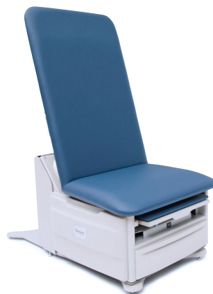
FLEX ™ Access Exam Table