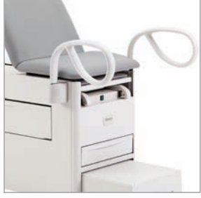
Patient Assist Handles for more confident transitions