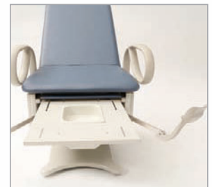
Stirrups, Pelvic Tilt & Drawer Heater