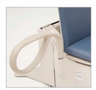
Patient safety grab bars