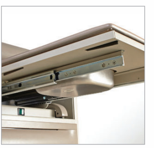
SafeGlide Leg Extension