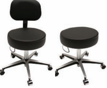
Model 11001B Model 11001 in Black (PR-40) in Black (PR-40)

B - Backrest FR - Footring V - Vacuum-formed/Seamless LCD - Locking casters G - Glides UL - Ultraleather™ upholstery