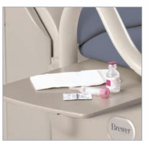
Pass-through Work Surface