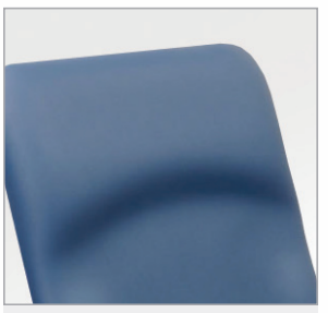
FLEX Premium Top

Available in two attractive upholstery tops