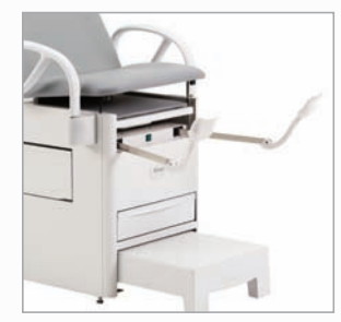
Women's Health Package includes warming tray, pelvic tilt and ergonomic stirrups