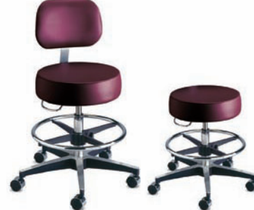
Model 11001BFR Model 11001FR in Cabernet (PR-36) in Cabernet (PR-36)

Models 11001B 11001BV 11001BLCD 11001BG* 11001B-UL 11001 11001V 11001LCD 11001G* 11001-UL