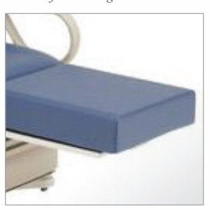
Optional footrest pad adds comfort and support for enhanced patient experience