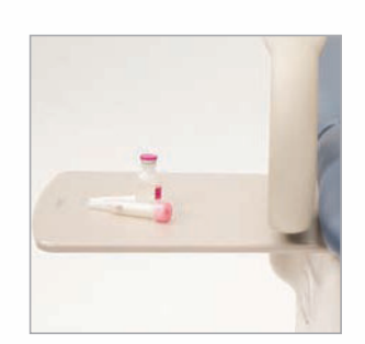
Pass-through Work Surface