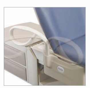
Patient safety grab bars