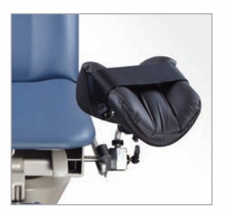
Deluxe Articulating Knee Crutches