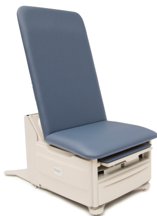
FLEX Access Exam Table