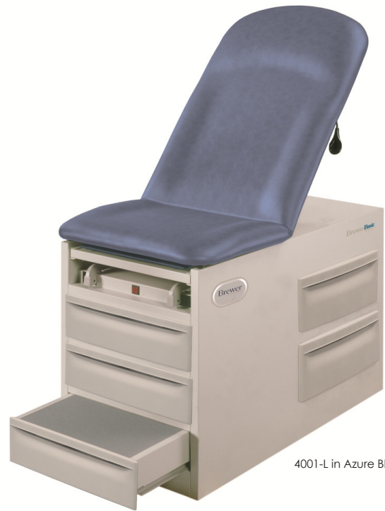
4001-L in Azure Blue