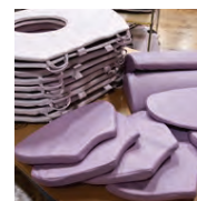
Ergonomic Design & Prototyping