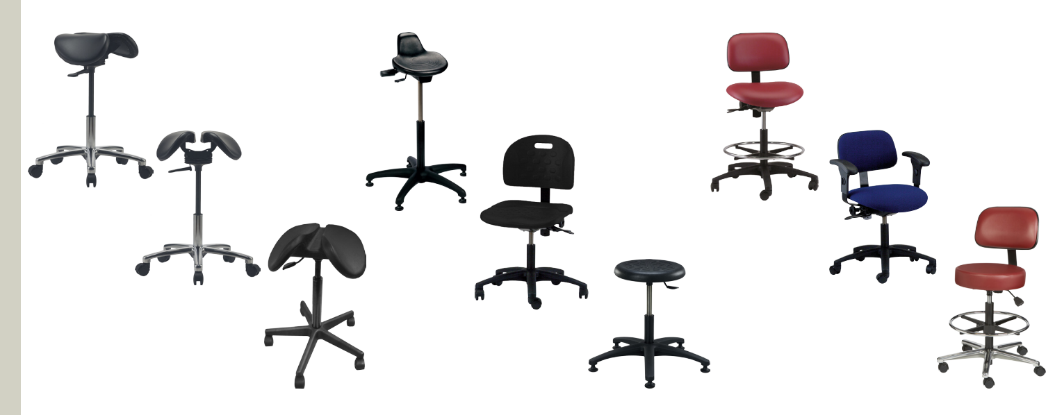
Cloth & Vinyl Stools