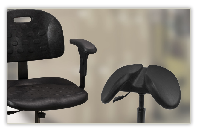
Quality, Safety, Comfortable, Durable, Ergonomic

With over 60 years of manufacturing experience, Brewer has become one of the most trusted names in commercial seating. Industrial settings require seating that is comfortable, durable, and safe, all at an unbeatable price. Drawing on our extensive ergonomic research with Marquette University's Departments of Engineering, we have developed a complete line of industrial-strength seating that meets your needs for performance, safety, comfort, and durability.