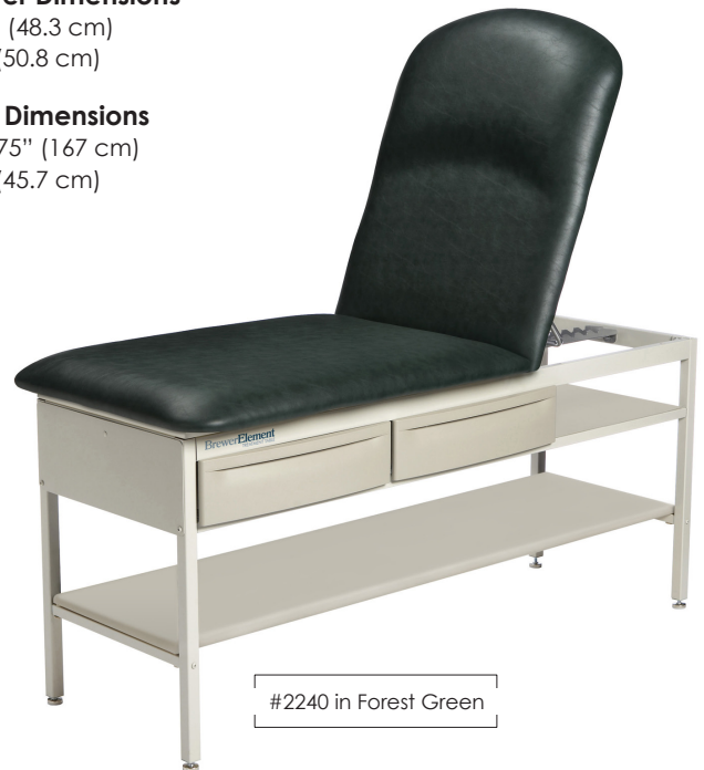
#2240 in Forest Green