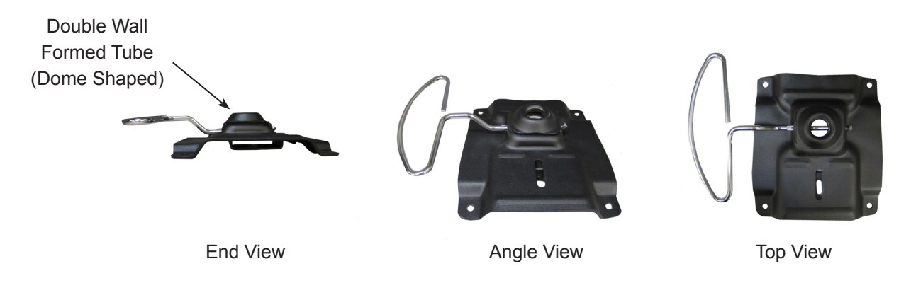
New Style Control Plate 2102167, from 13-Feb-2013 on